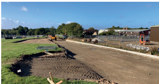
The New Access Road is well underway