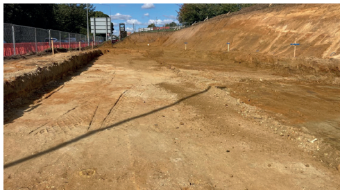
Excavation works to the new eastern extents are progressing well